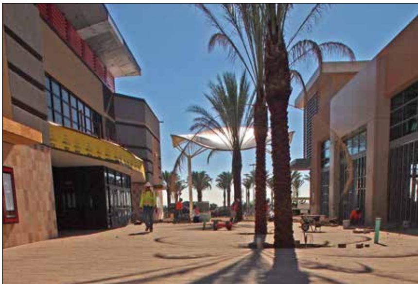
The finished Summerlin Centre provides a beautiful shopping environment

Architect: ELS Architecture & Urban Design, Altoon Porter Architects