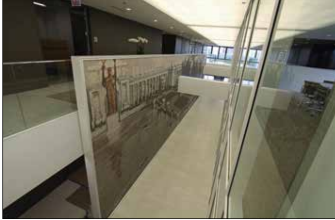
Another view of the historic Chicago World's Fair mural

application of Keraply and P-10 Adesilex. The glass mosaic tiles were then installed using a mixture of Keraply and P-10 Adesilex and grouted with a neutral basis epoxy grout developed by MAPEI for Bisazza.