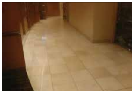
Another view of the lobby