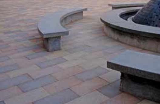
Detail of tilework and outdoor seating around the fountain

Superior fielded over 150 employees, each of whom took great pride in the quality of their work. This extremely challenging project pushed the Superior team to its limits. In the end Superior stood out, driving preceding trades to completion of their work and completing the work of another.