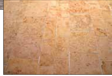
Variety of brick, stone and tile materials used