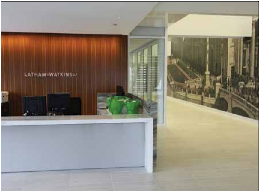
View from the lobby of Latham & Watkins

A major challenge in installing paper-faced mosaics is not being able to see what's being installed. In this case, there were a number of instances where the individual mosaic tiles came off the paper transfer sheet, requiring the installers to fill in after the paper was pulled. When this occurred, the installers would use a carbide tipped Dremel tool to remove the cured thinset in the spot where the 3/8" square tile should have been, select the appropriate color tile and install it with a quick setting mortar.