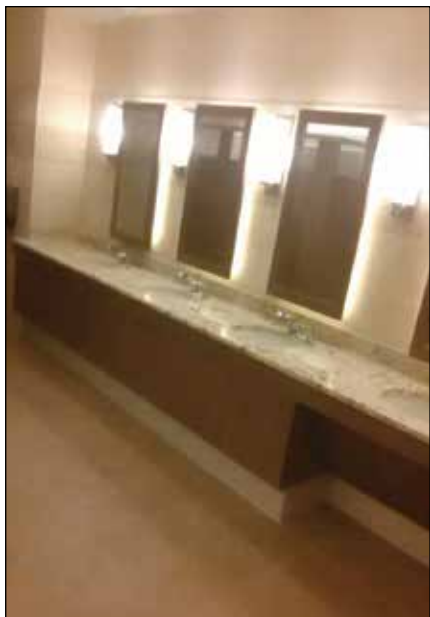
Greektown Casino men's room vanity area with granite, modern fixtures, cherry wood cabinets and mirrors, and beige/white tile design.

real easy to pick up the phone, call a Business Agent in a different town and put a face to a name.”