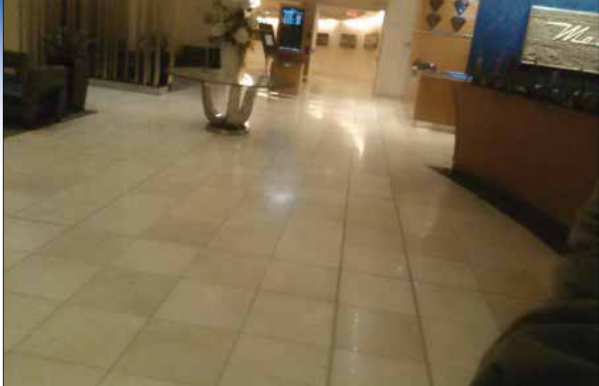
The Motor City Casino lobby

“She understood what a family business was all about and she understood the risks and rewards of construction work.”